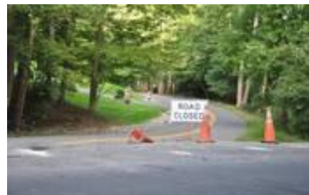
Towlston Road remains closed west of Old Dominion Drive due to the Sept. 8 flooding. The road is expected to be repaired within six weeks, according to VDOT.