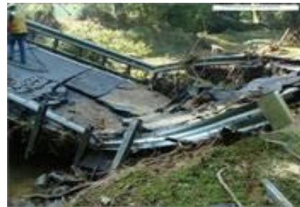
Beach Mill Road over Nichols Branch in Great Falls: A contract will be awarded next week to install a temporary culvert. The posted detour is approximately six miles long.

Our next meeting will be Tuesday, October 4; 7-9 pm at the library.